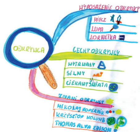
Fig.1. Sample Mind Map: Discoverer (student, 11 years).